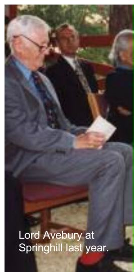
Lord Avebury at Springhill last year.